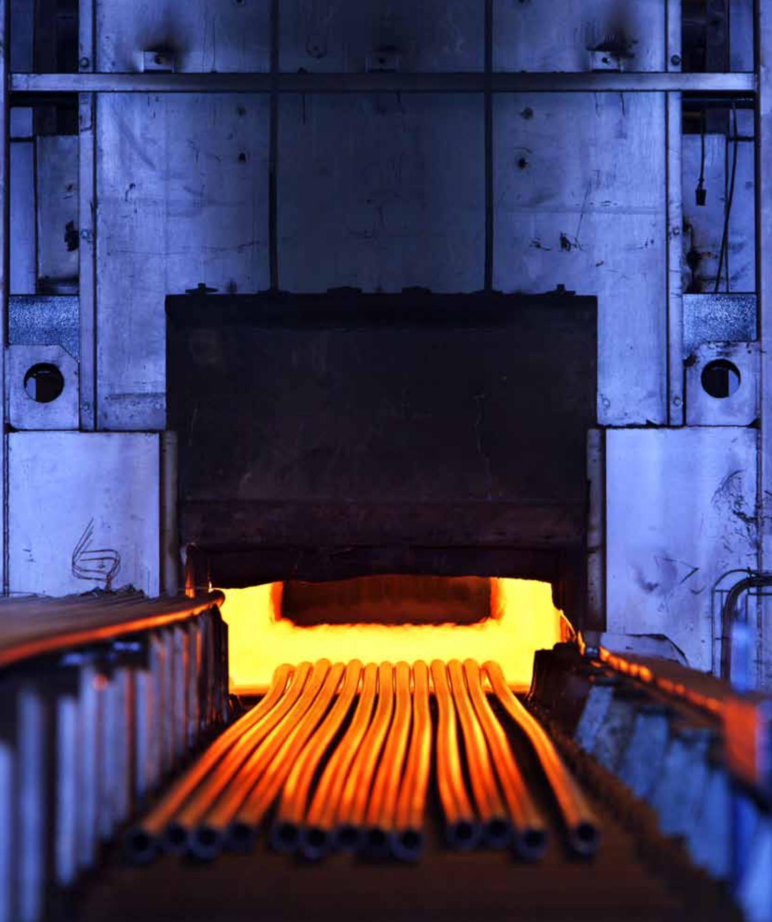
Furnace rollers made from Kanthal APMT™ are setting new performance standards in the tube manufacturing industry. Used to transport stainless steel tubes annealed in roller hearth furnaces, the new furnace rollers made from Kanthal APMT can operate at higher temperatures and last up to four times longer than conventional furnace rollers. They also require less water cooling (and, in some applications, no water cooling at all), making it a greener option.